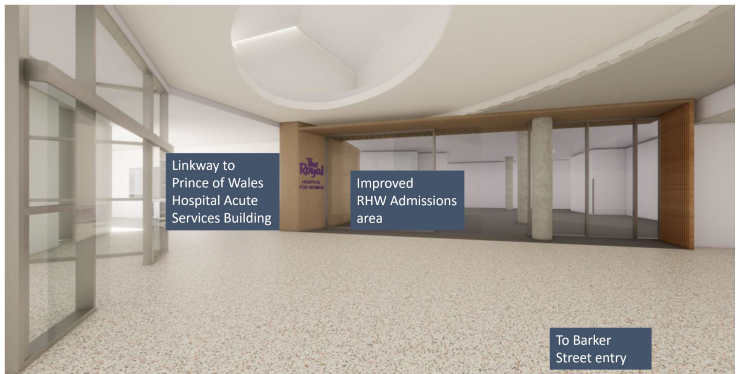
Pictured: Early artist impression of the new public linkway and Royal Hospital for Women refurbishment

Find more information about the works here.