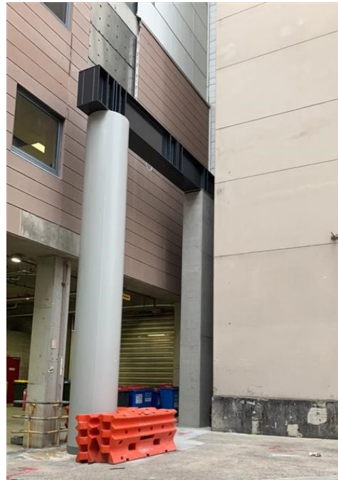
Pictured left to right: Electrical switch equipment for the ASB; the first headstock to support the clinical link bridge

This monthly newsfeed provides updates on the Randwick Campus Redevelopment, featuring stories and highlights from the Randwick Hospitals Campus partners, as they bring together world-class education, research and healthcare through the creation of the Randwick Health & Innovation Precinct.