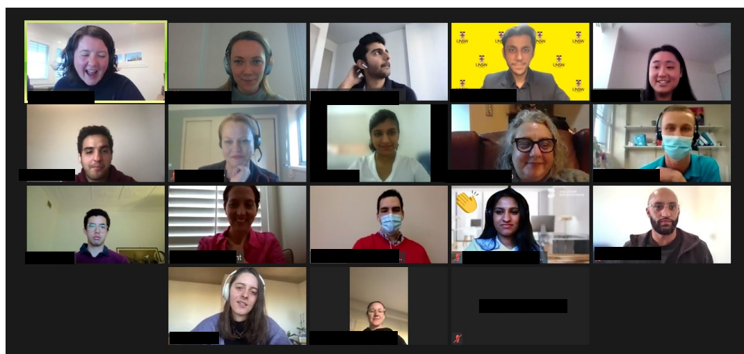
Pictured: The Student and Early Career Reference Group during one of their online forums. The group look forward to meeting face-to-face in 2022.

Next year, the group would like to turn their focus towards issues like integrating education at the Precinct, equity and accessibility for culturally and linguistically diverse communities, virtual care and strategy.