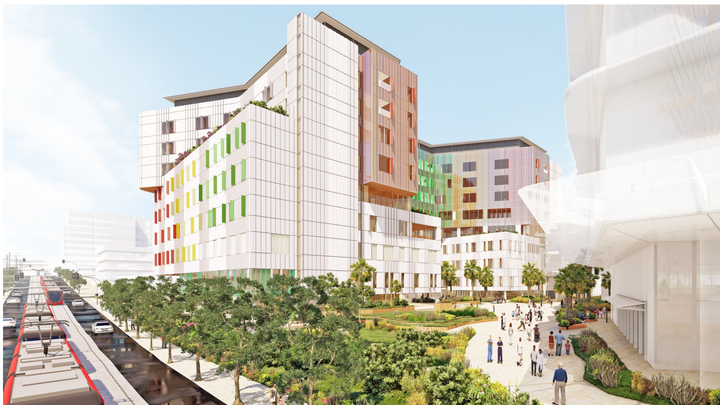
Artist impression of the view from High Street, Randwick, May 2021

For staff across the Sydney Children's Hospital, Randwick and the Children's Cancer Institute, the building will open opportunities for deeper collaboration and innovation across our partner organisations, provide significantly improved staff zones, increase the availability of outdoor and respite areas, and provide access to new precinct end of trip facilities to improve access to sustainable travel choices.