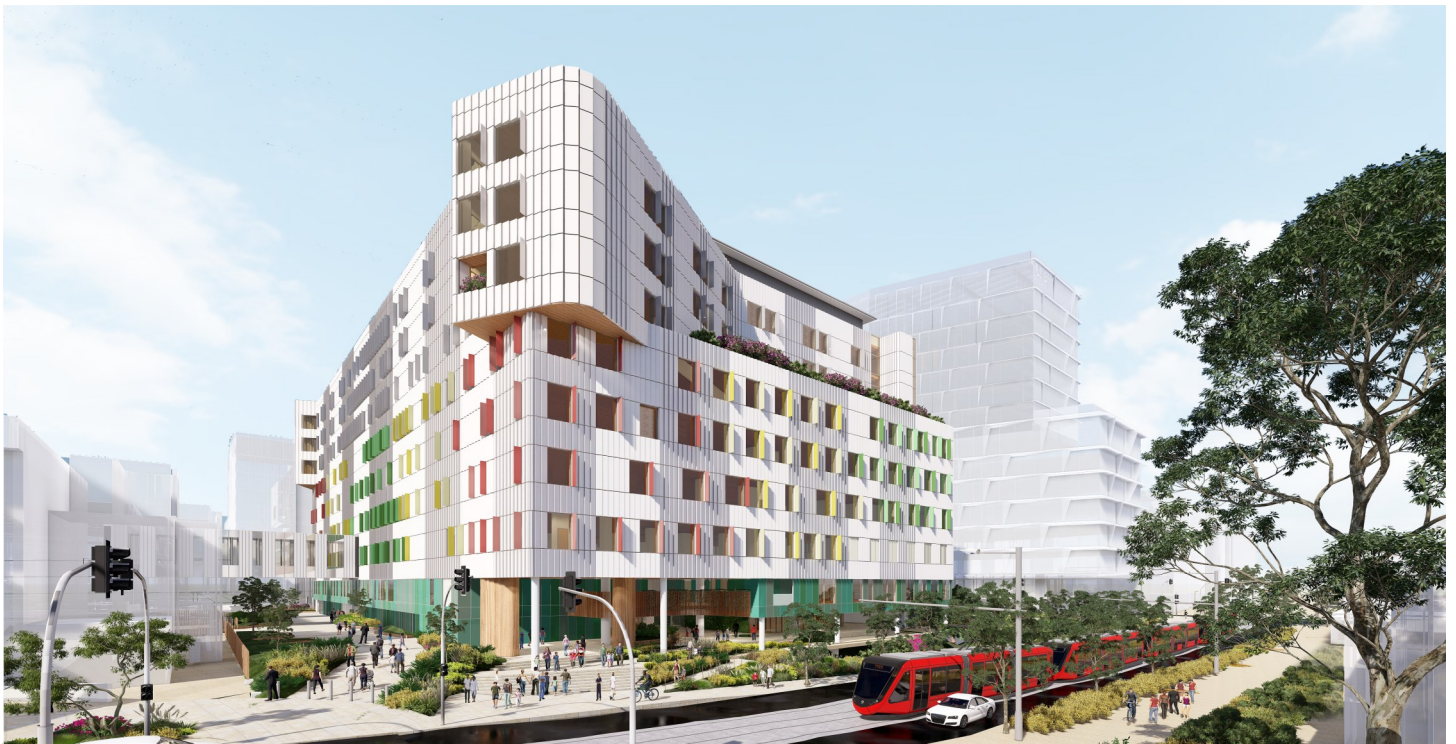
Artist impression of the new children's hospital and research facility, view from High Street, May 2021

Both the Sydney Children's Hospital Stage 1 and Children's Comprehensive Cancer Centre are being delivered together as a single project in an integrated facility, to transform paediatric health care locally, nationally and globally. Extensive consultation is underway to design and plan for the new facility. We see this as a generational opportunity to reimagine the way care is delivered and will have a lasting impact on children and their families.