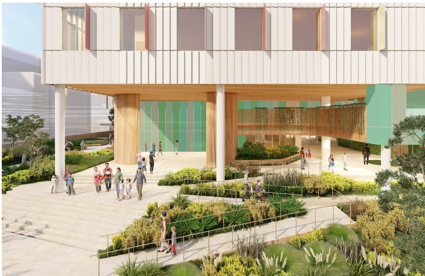
Artist impression of the new High Street public entry, May 2021