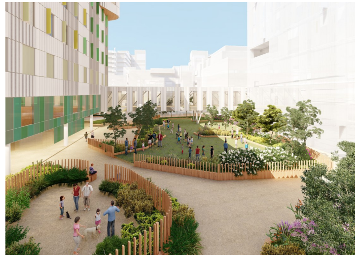
Artist impression of the children's play area, May 2021

The new building will be a safe and welcoming for all community, with the provision of areas such as the dedicated Aboriginal and Torres Strait Islander gathering space for families in the Front of House.