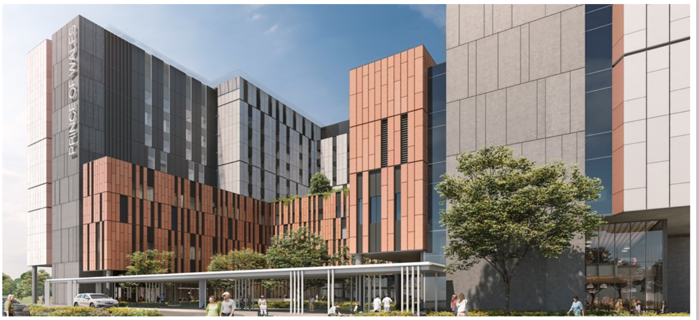
Integrated Acute Services Building, view from Botany Street. Opening 2022.

The NSW Government is partnering with UNSW Sydney to deliver the Integrated Acute Services Building (ASB); the first stage of the Randwick Campus Redevelopment and the catalyst project for expanding the world-class health, research and education facilities at the Randwick precinct.