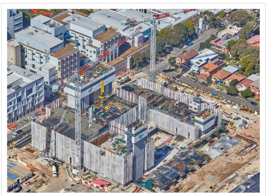
Aerial view of construction works underway at the Randwick Campus Redevelopment site.

emergency access maintained under the support of traffic control.