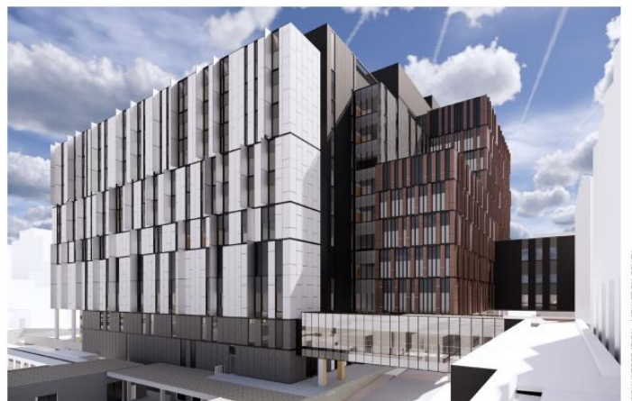
Figure 2 - UNSW Eastern Extension