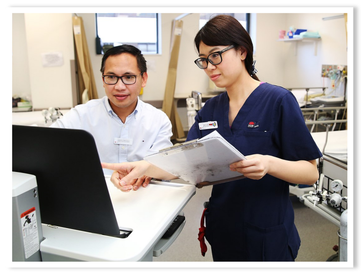
Nuclear medicine staff using ICT

Commencing early April 2019, the ICT and redevelopment project teams will be meeting again with campus staff, community and consumers in a variety of forums to understand ICT's role in the patient journey and set out a roadmap for future capabilities.