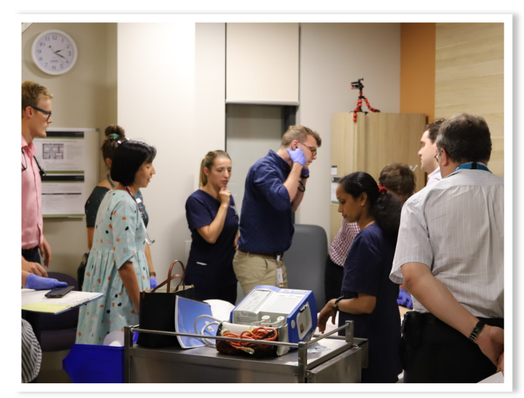
Prince of Wales CERS Team conducting code blue scenario test

This exercise was part of testing for the new inpatient toeto-toe two bed rooms in the Acute Services Building, which opens in 2022.