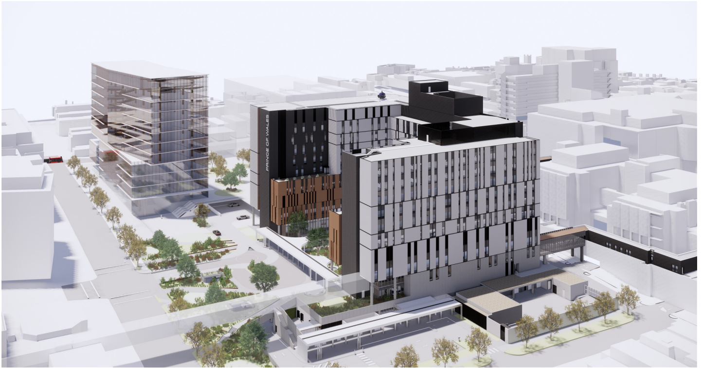
Artist's Impression of the Acute Services Building, view from Botany Street. Opening 2022