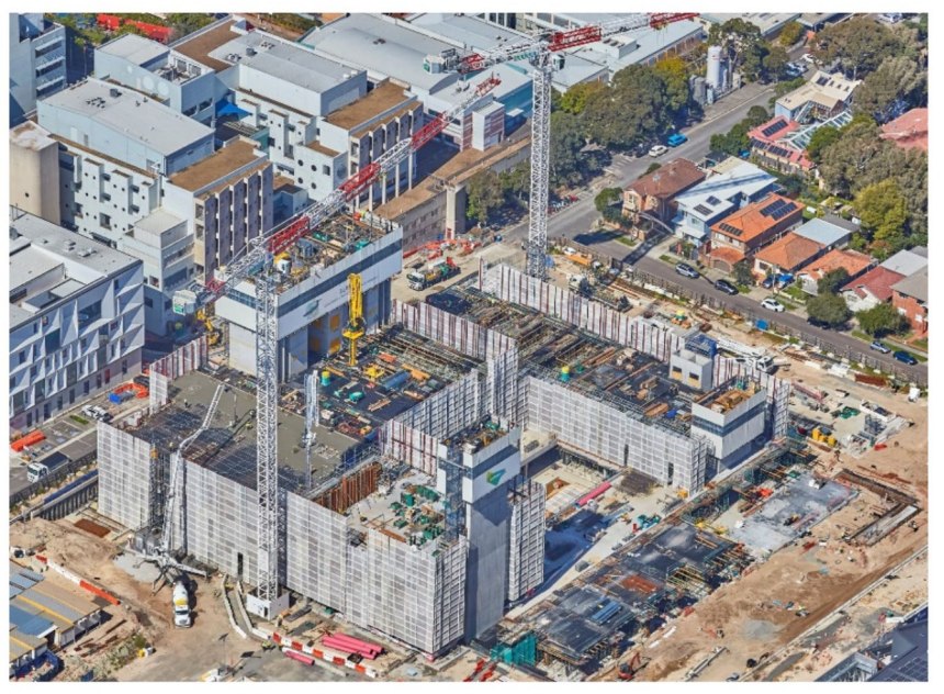
Aerial view of construction works underway at the Randwick Campus Redevelopment site.

We thank you for your patience while we expand our world-class health, research and education facilities.