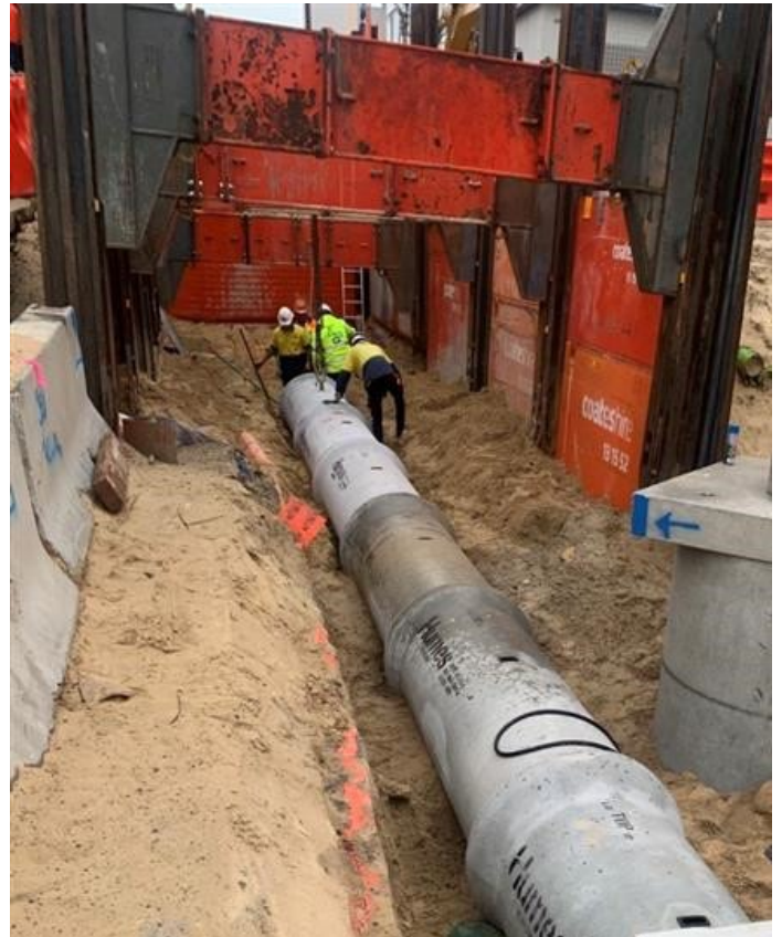
The construction team installing new stormwater infrastructure in Hospital Road

We encourage you to get in touch if you have any questions or feedback: