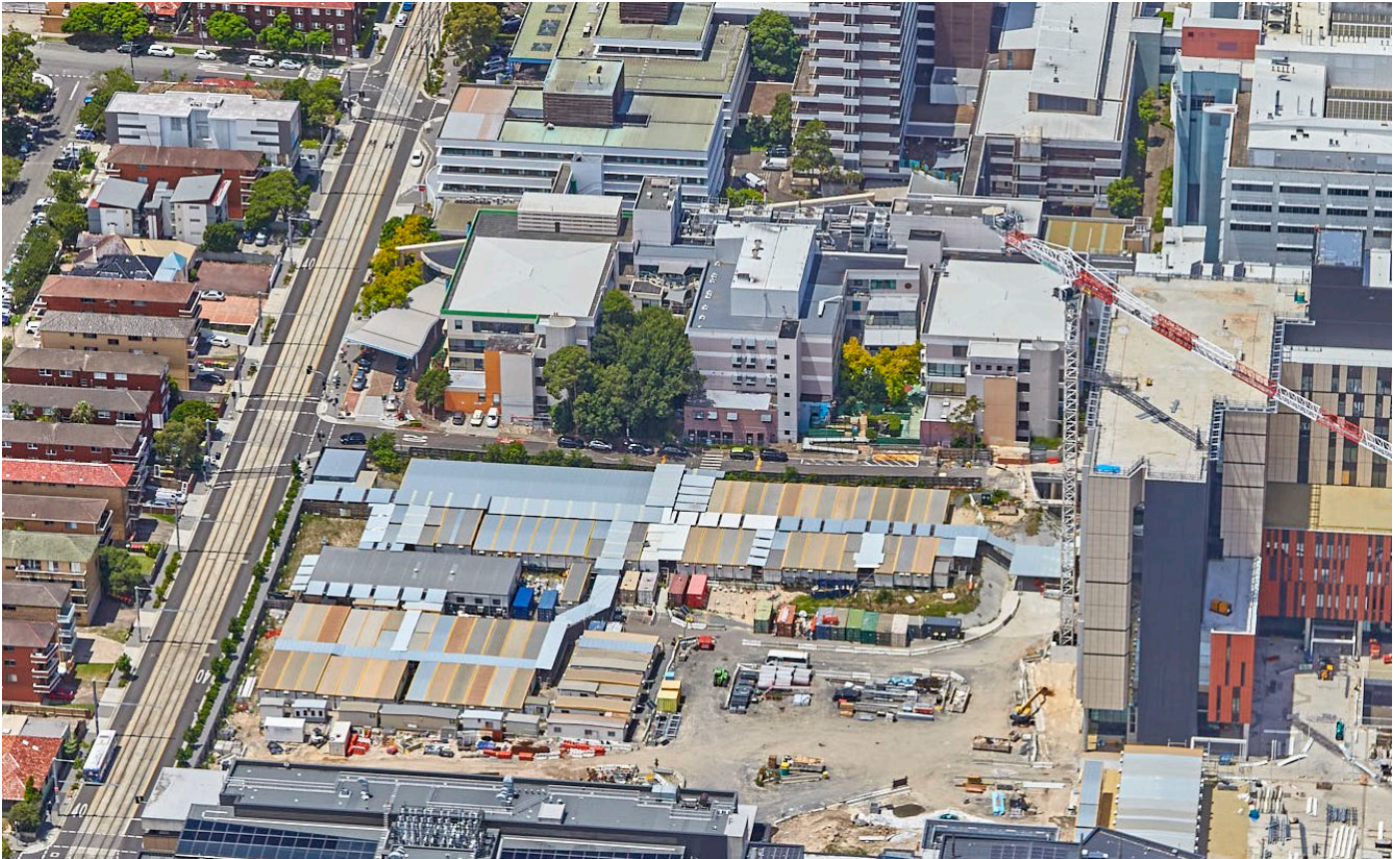
Aerial view of the Randwick Campus Redevelopment and Hospital Road north