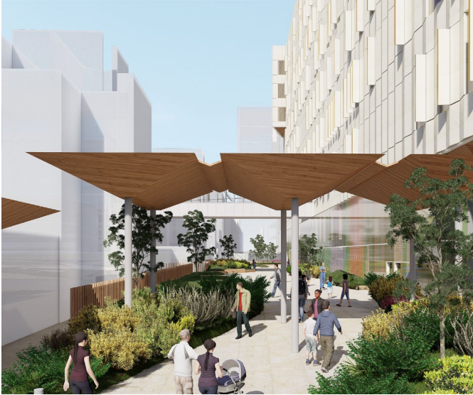
Artist impression of Hospital Road pedestrian plaza following the upgrades

In the future Hospital Road north will provide underground ambulance access to the new Children's Emergency and a ground level pedestrian plaza for staff, patients, students and the community to enjoy above.