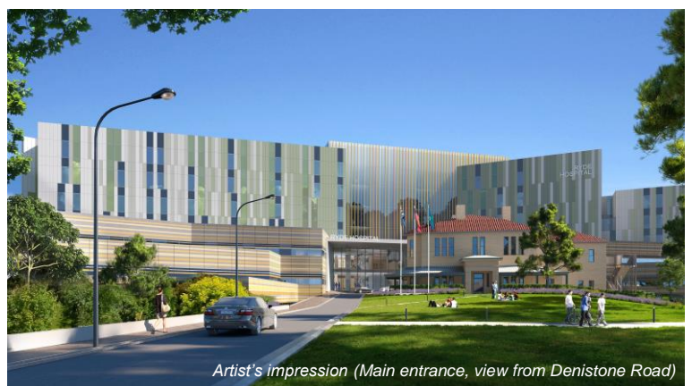
Artist's Impression (Main entrance, view from Denistone Road)

The redevelopment will increase capacity and include new and expanded facilities, including a new emergency department, intensive care unit and operating theatres. The future hospital is designed to meet the health needs of this growing community, with more than 180,000 people expected to call the Ryde area home by 2041.