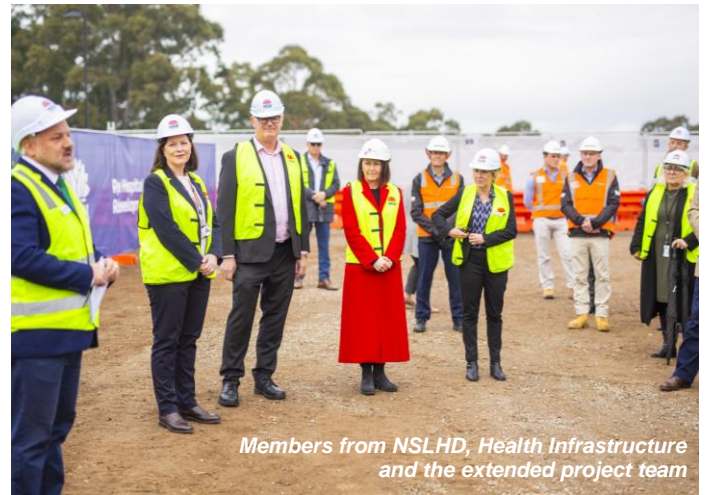
Members from NSLHD, Health Infrastructure and the extended project team

This is an official event attended by key decision makers of the project, such as government officials, project directors and the appointed contractor. It marks the beginning of construction for the project and celebrates the accomplishments achieved over the past four years of planning.