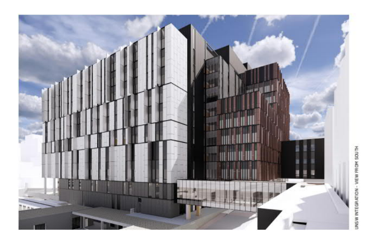
Figure 2 - UNSW Eastern Extension